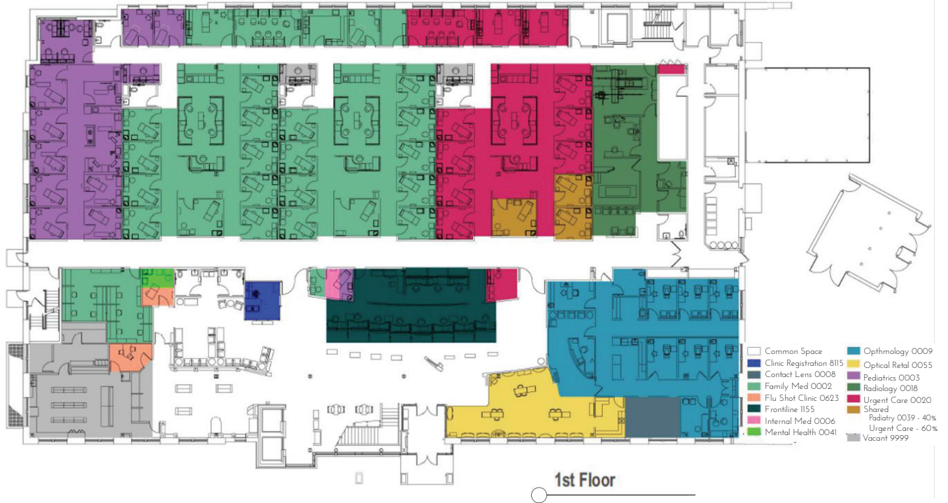
FIGURE 3 PHC FACILITY DESIGN FOR MULTIDISCIPLINARY AND INTERDISCIPLINARY CARE